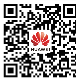
Huawei IT Products & Solutions - LinkedIn