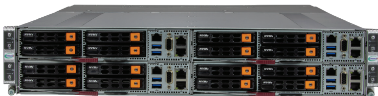
A+ Server 2115GT-HNTF (with front I/O)