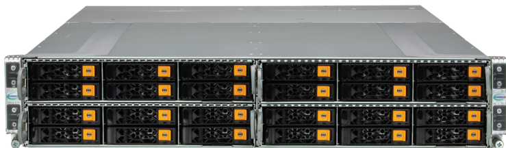
A+ Server 2115GT-HNTR (with rear I/O)