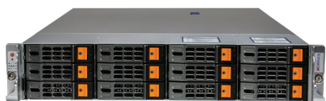
2U A+ Server 2025HS-TNR (NVMe/SAS/SATA)