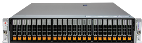
2U A+ Server 2125HS-TNR (NVMe/SAS/SATA)